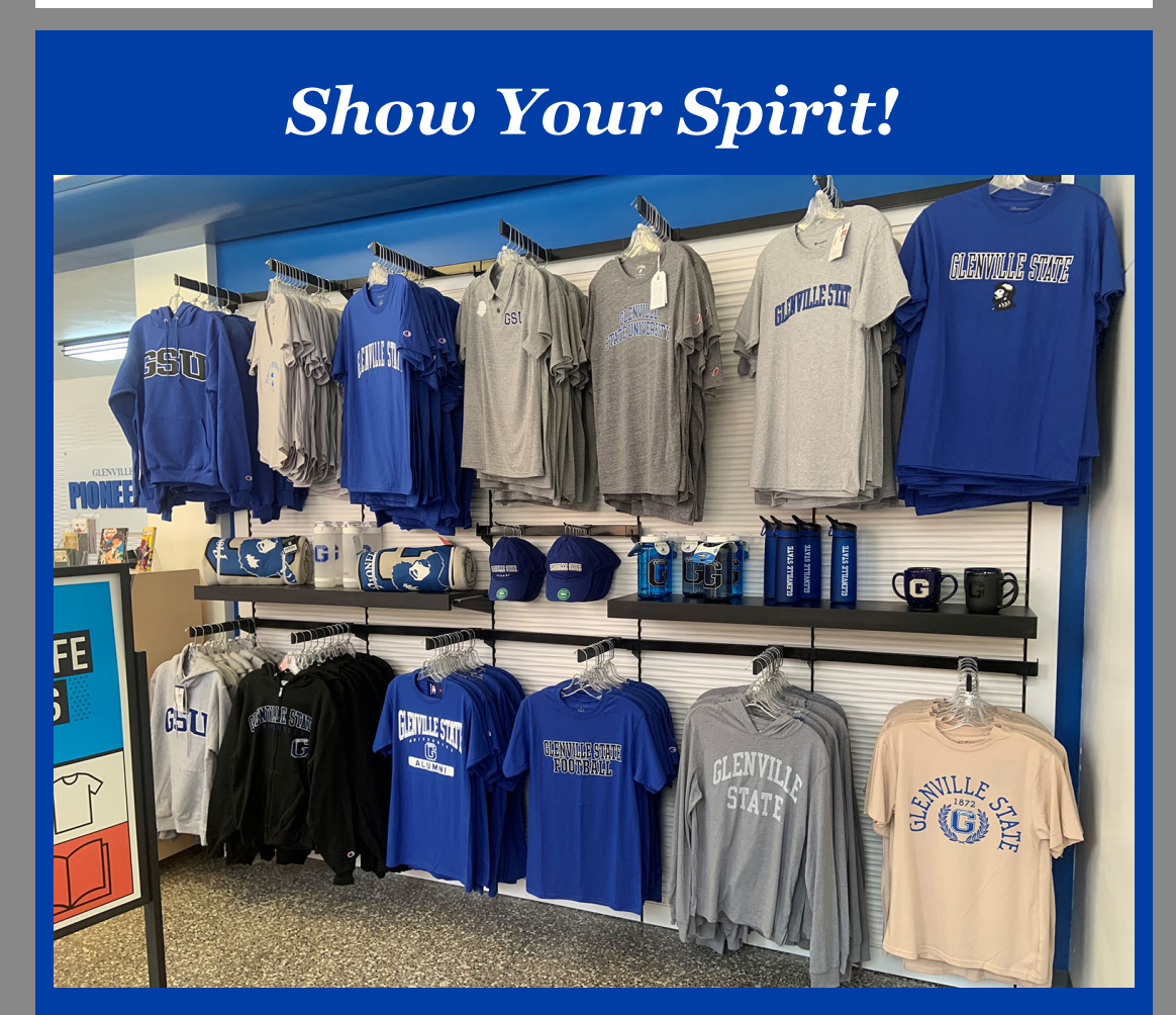
Shop Now: glenville.spirit.bncollege.com