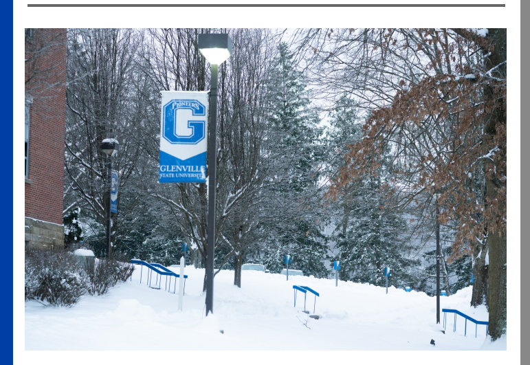
Snow blankets the ground in front of the Heflin Administration Building.

The Day of Giving website - \underline{give.glenville.edu} - opens on February 10.