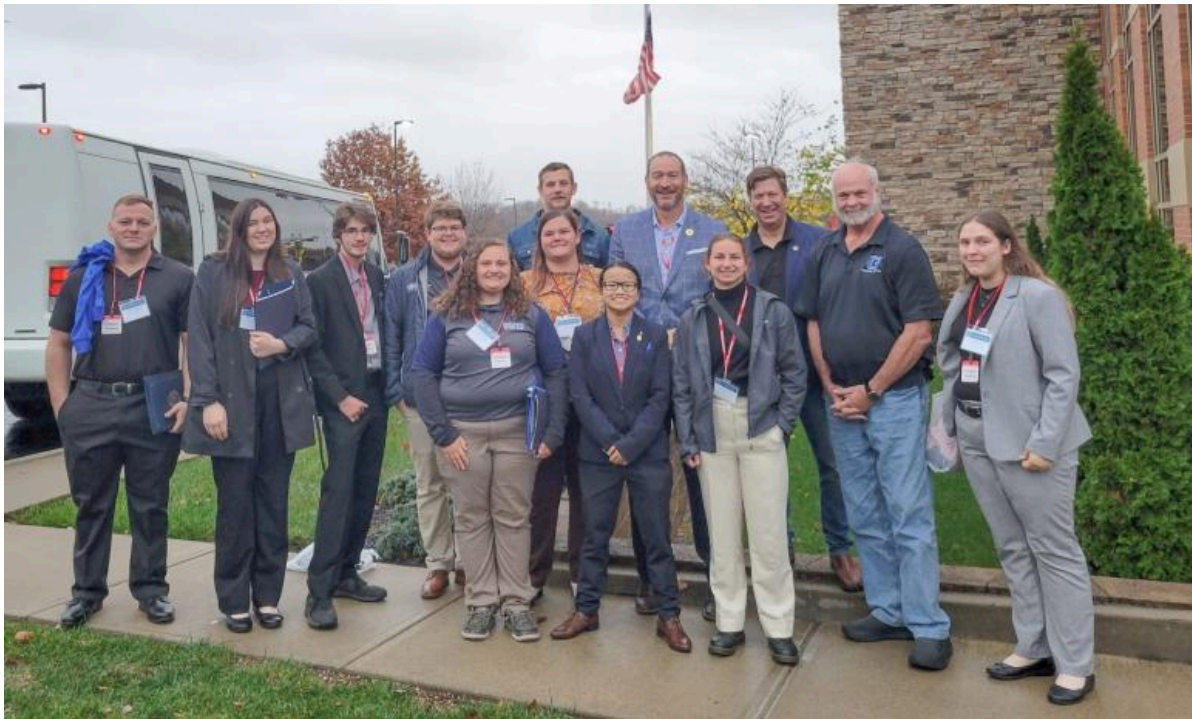
Several Glenville State University students attended the 2024 FBI Collegiate Academy, which was held in Clarksburg, West Virginia in November 2024.