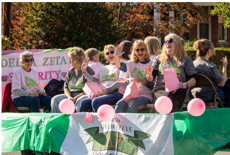
Several Delta Zeta sisters returned to Glenville to take part in the Homecoming Parade.