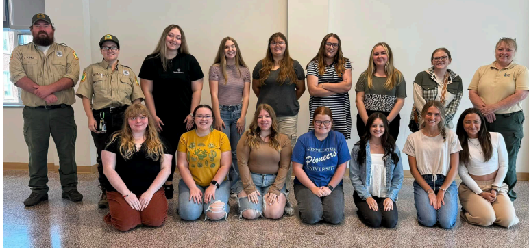
Current Glenville State University students from the SCNC 204 course with WV Division of Forestry employees after completing the Project Learning Tree workshop.

Contact alumni@glenville.edu with any questions.