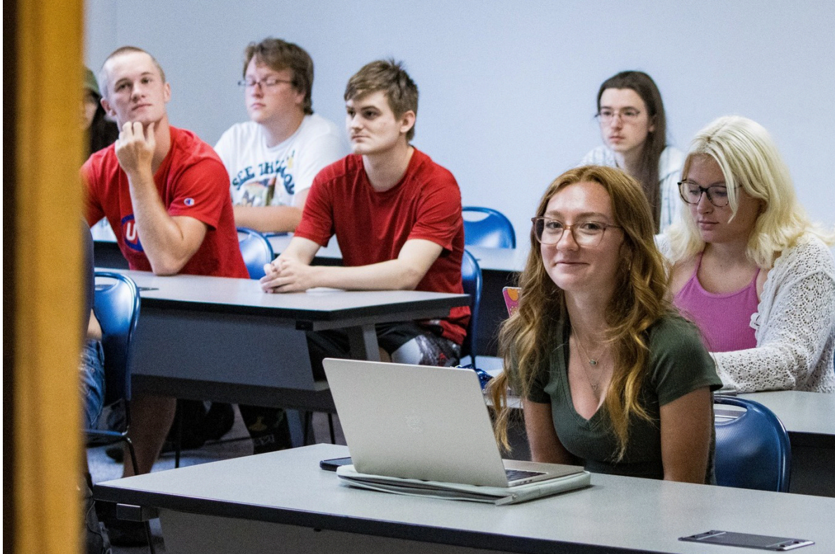
Students spotted through the door of a classroom in the Heflin Administration Building on the first day of fall 2024 semester classes.

If you were unable to attend the Celebration of Life, view a partial recording of the event here .