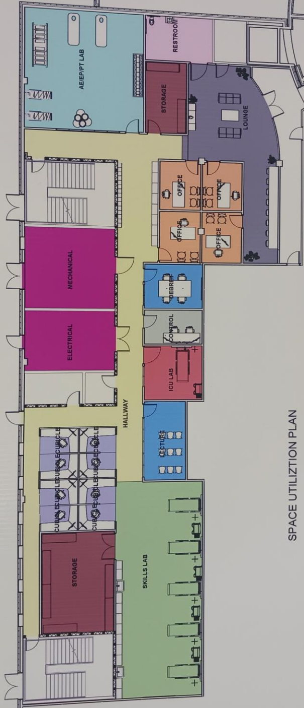
SPACE UTILIZATION PLAN