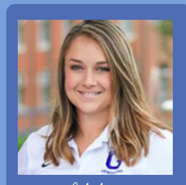
ACADEMIC SUCCESS CENTER