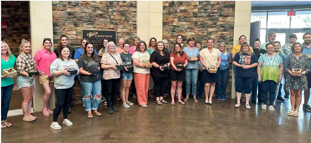
Some of the participants of the recent GSU Women's Leadership Circle event show off their graze boxes.

Repairs are also being made to the Health and Physical Education Building. Anyone who has visited campus over the past few weeks may have noticed that parts of the PE Building are closed. This is due to an issue with the limestone trim that is part of two of the entrances to the building. The masonry work unexpectedly failed and some of the stones either fell or were at risk of doing so. For safety purposes, the main entrance to the building has been closed until repairs can take place. The building is still accessible via the entrance closest to the Public Safety Office or the doors nearest Clark Hall.