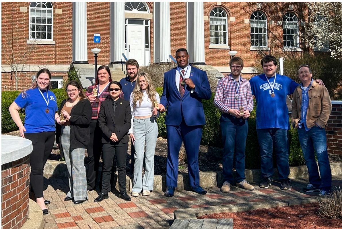
Members of the Pioneer Debate Team following last month's debate tournament that was held on campus.