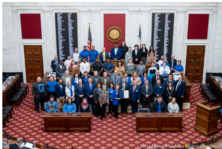
Glenville State University students, faculty, staff, alumni, and friends are recognized by the West Virginia House of Delegates as part of GSU Day at the Capitol.