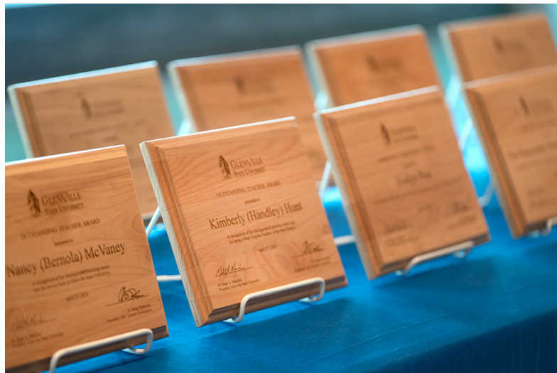
Plaques on display before the 2024 Glenville State University Alumni Awards Banquet.