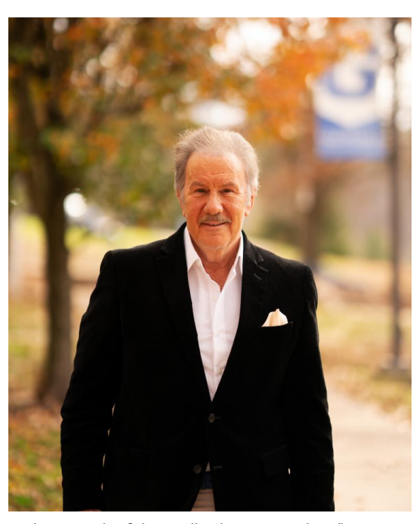
make meaningful contributions to society."

Questions? Contact <u>alumni@glenville.edu</u> or call (304) 462-6116.