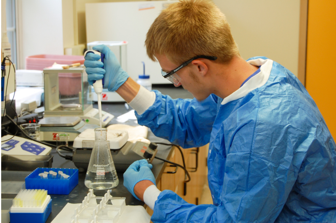
A HSTA camper analyzes evidence in one of the Science Hall labs.

becomes the 84th student to portray the Pioneer Mascot. She will be the eighth woman to serve as the Pioneer.