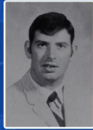
Sterling Beane Football Wrestling 1970