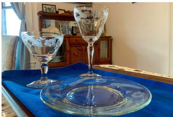
Pieces of Ludwik glass on display inside the GSU Alumni Center.

Click here or call (304) 462-6382 to learn more about membership benefits and how to enroll.