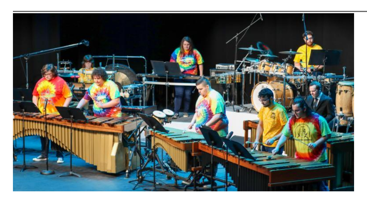
Members of the GSU Percussion Ensemble performing at their spring concert.

Congratulations Lady Pioneers! You can read more about their road to victory by clicking here.