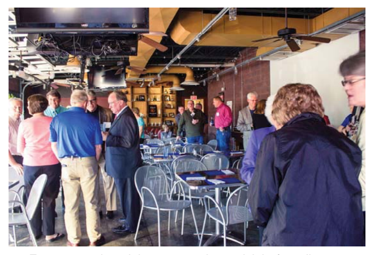
Everyone enjoyed the opportunity to visit before dinner.