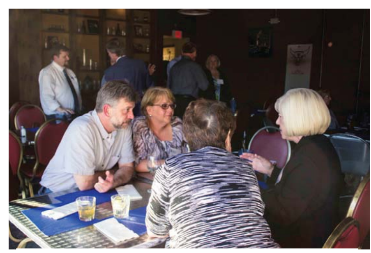
Networking and the sharing of special memories make our alumni gatherings extra special events