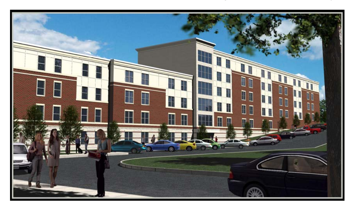
Artist's rendition of the new dorm that is being built on the campus of Glenville State College. Once completed, the residence hall will house around 500 students.