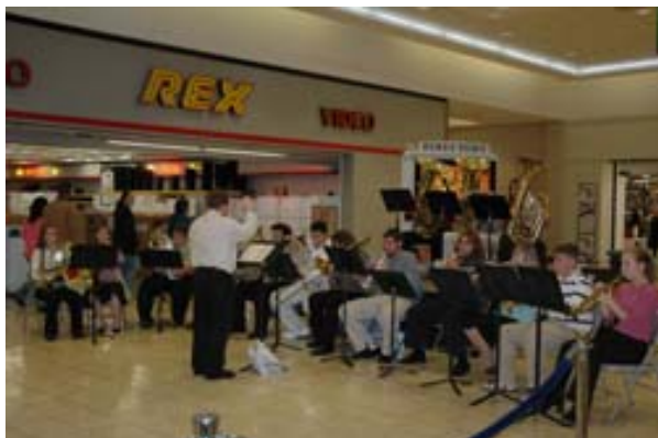
GSC's Brass Ensemble performed for shoppers at the Meadowbrook Mall in Bridgeport before the evening's alumni event elsewhere in Bridgeport