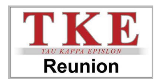
Although not pictured, some of the TKE's were back as well.