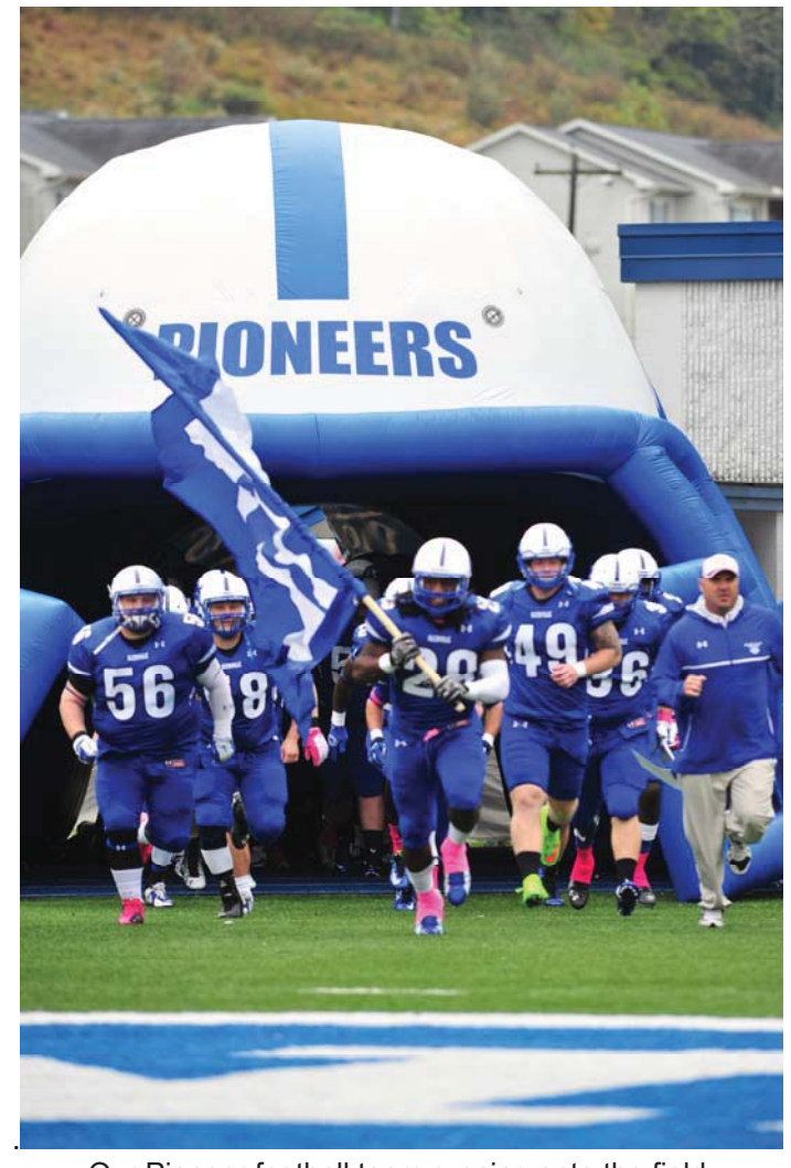
Our Pioneer football team running onto the field